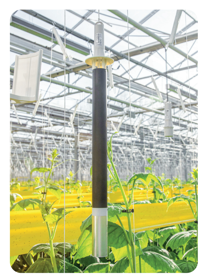
T/RH sensor with Radiation shield installed in the greenhouse.