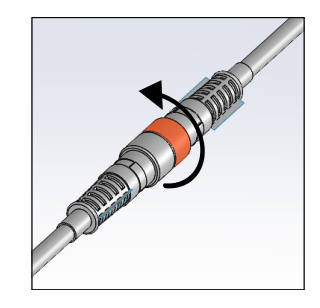
Step 2: Use your fingers to securely tighten the locking nut until it is snug.