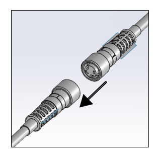
Step 1: Align the pins of the connector and firmly insert it into place.